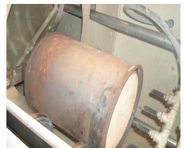
Air Knife Processing