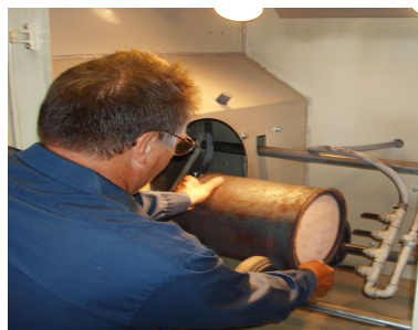
Air Knife both Sides