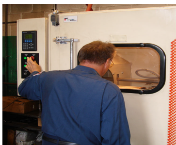
Program Cycle Rotation and Cycling Times