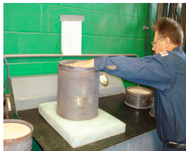
Testing air Flow